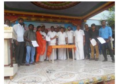
JOBFAIR AT MANALI

Equitas conducts job fair for the unemployed underprivileged youth and has helped 2165 youth to get job offers in the month of March 2018. Cumulatively has helped 131674 youth to get employment opportunities so far.