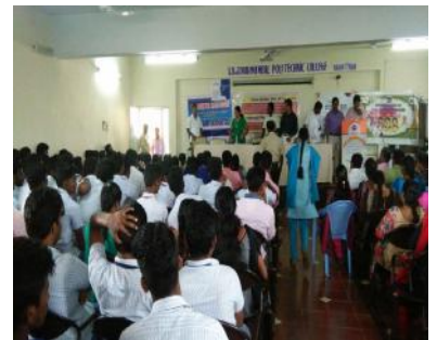
JOBFAIR AT NAGAPPATINAM