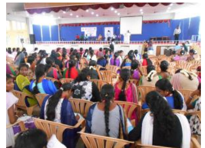
JOB FAIR AT DINDIGUL